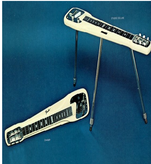
Some great looking fenders From Brad's Page of Steel site!

Burnout can be a killer to the soul, something that robs us